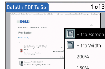
Fig 6 Maximise

Click on the Back icon to get back to the main menu (represented by an icon with an arrow pointing left). By clicking on the top menu or selecting from the bottom menu icons, you can now perform various functions such as sending the document to a printer (needs additional software), beaming it to another device or deleting it. ●